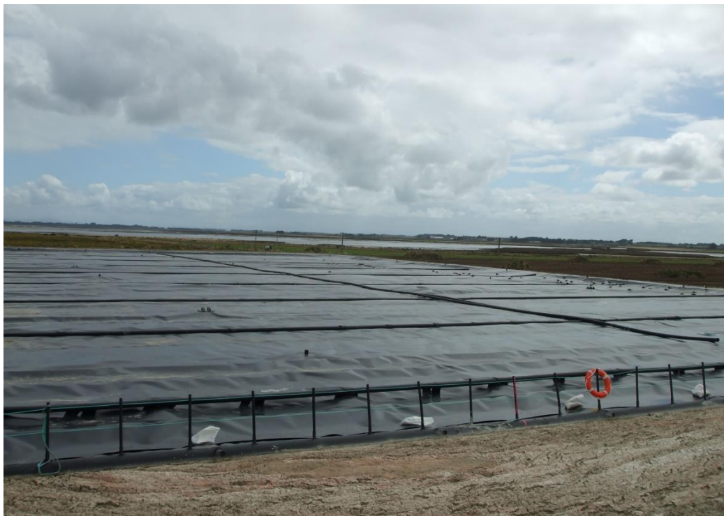
AEL Cover being installed over working Process Lagoon.