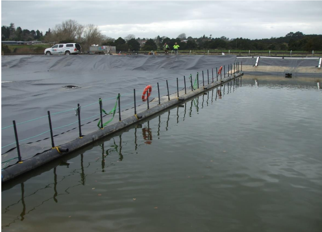
AEL Floating Cover being installed over a Wastewater Pond