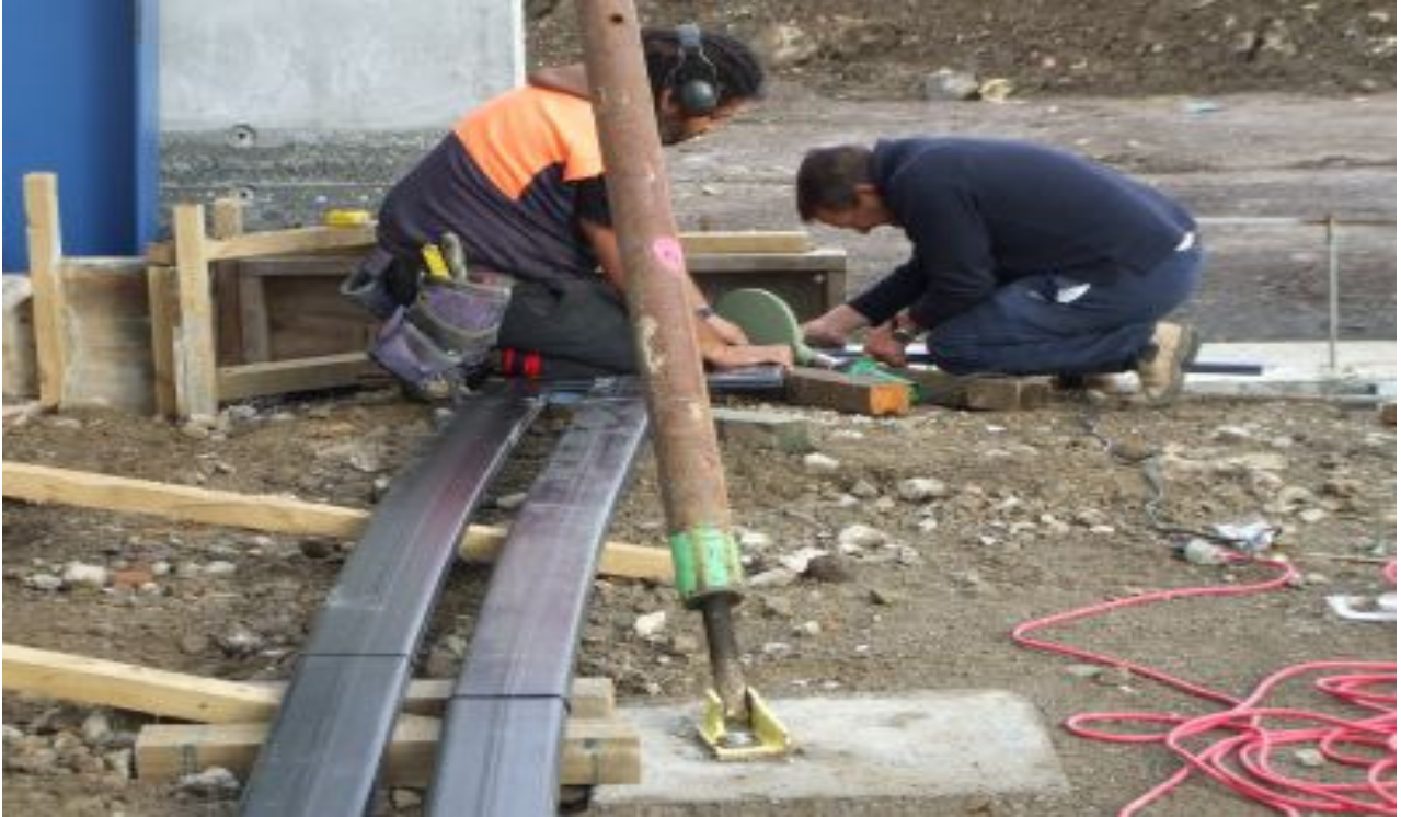
HDPE Poly lock fabrication.