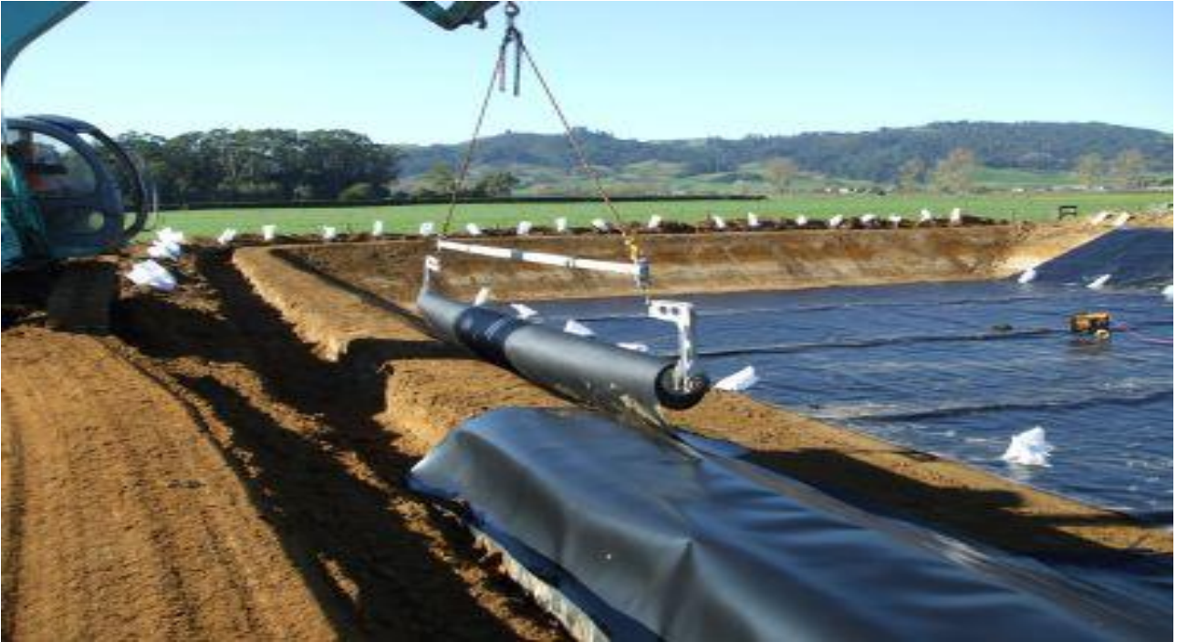
Liner installation at a Dairy Effluent Upgrade.