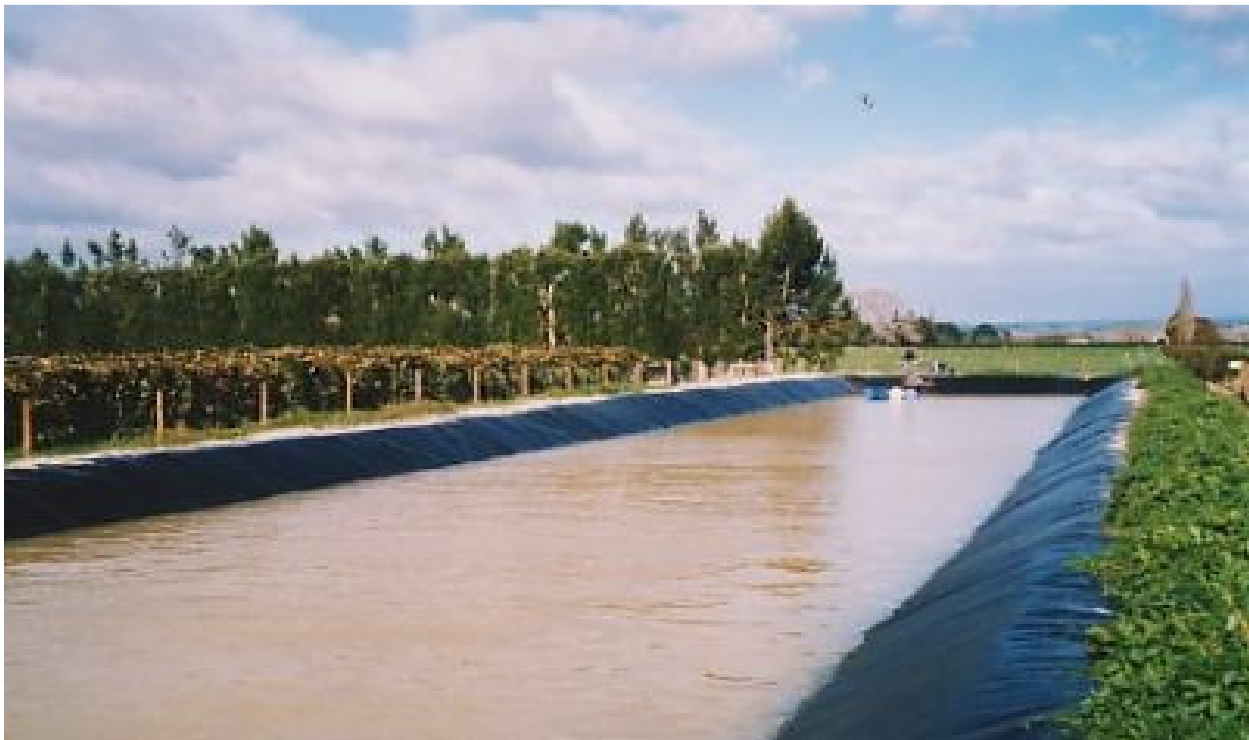
Completed Liner at Kiwifruit Orchard.