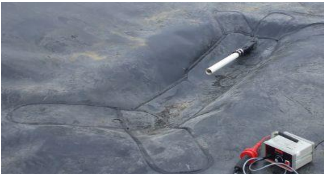
Drainage sump penetration and Spark Testing Apparatus.