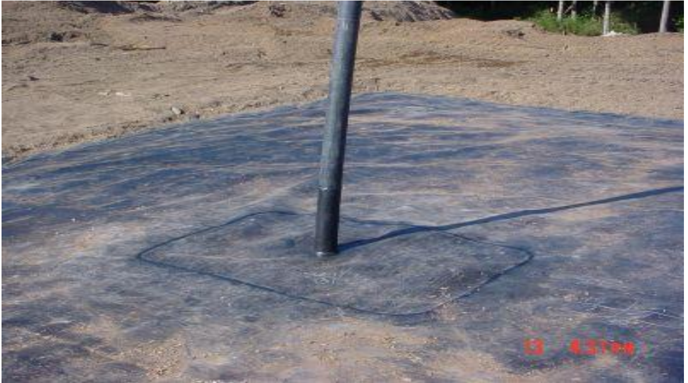
Standpipe penetration through capping liner.