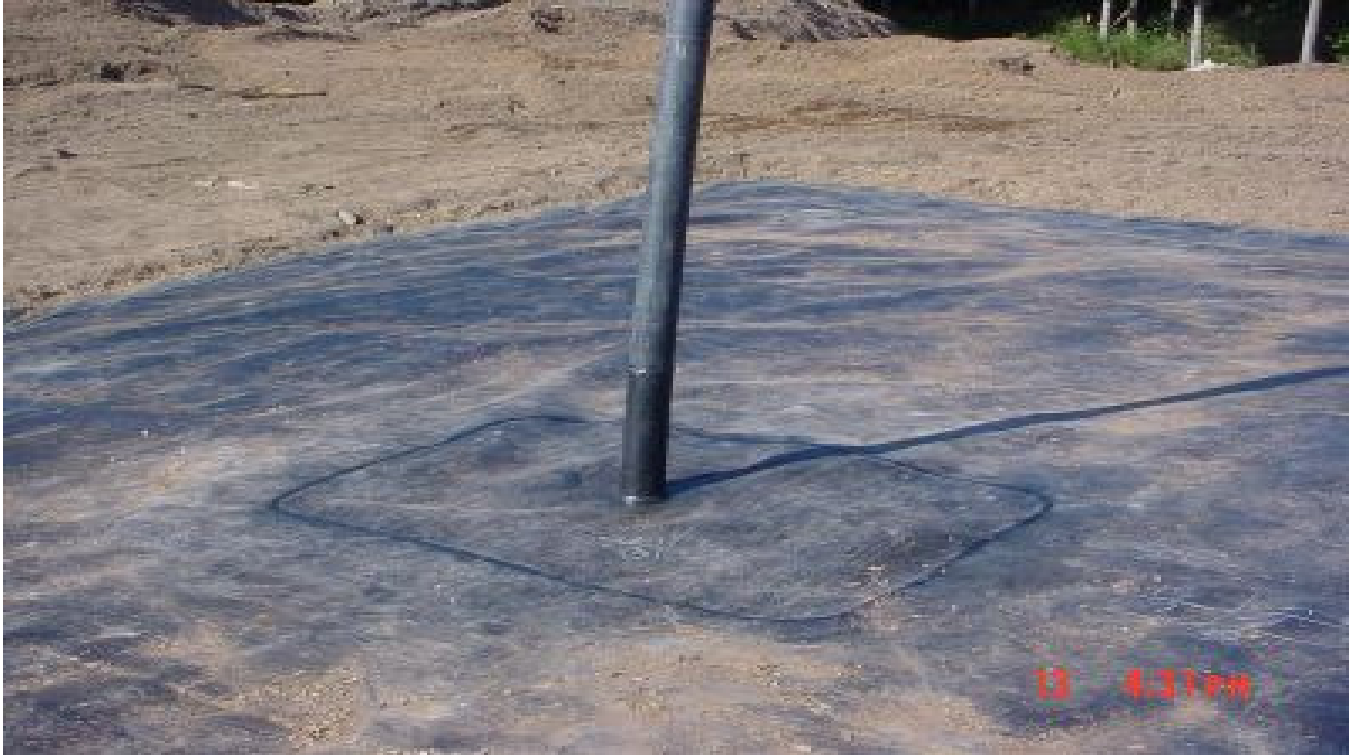
Standpipe penetration through capping liner.