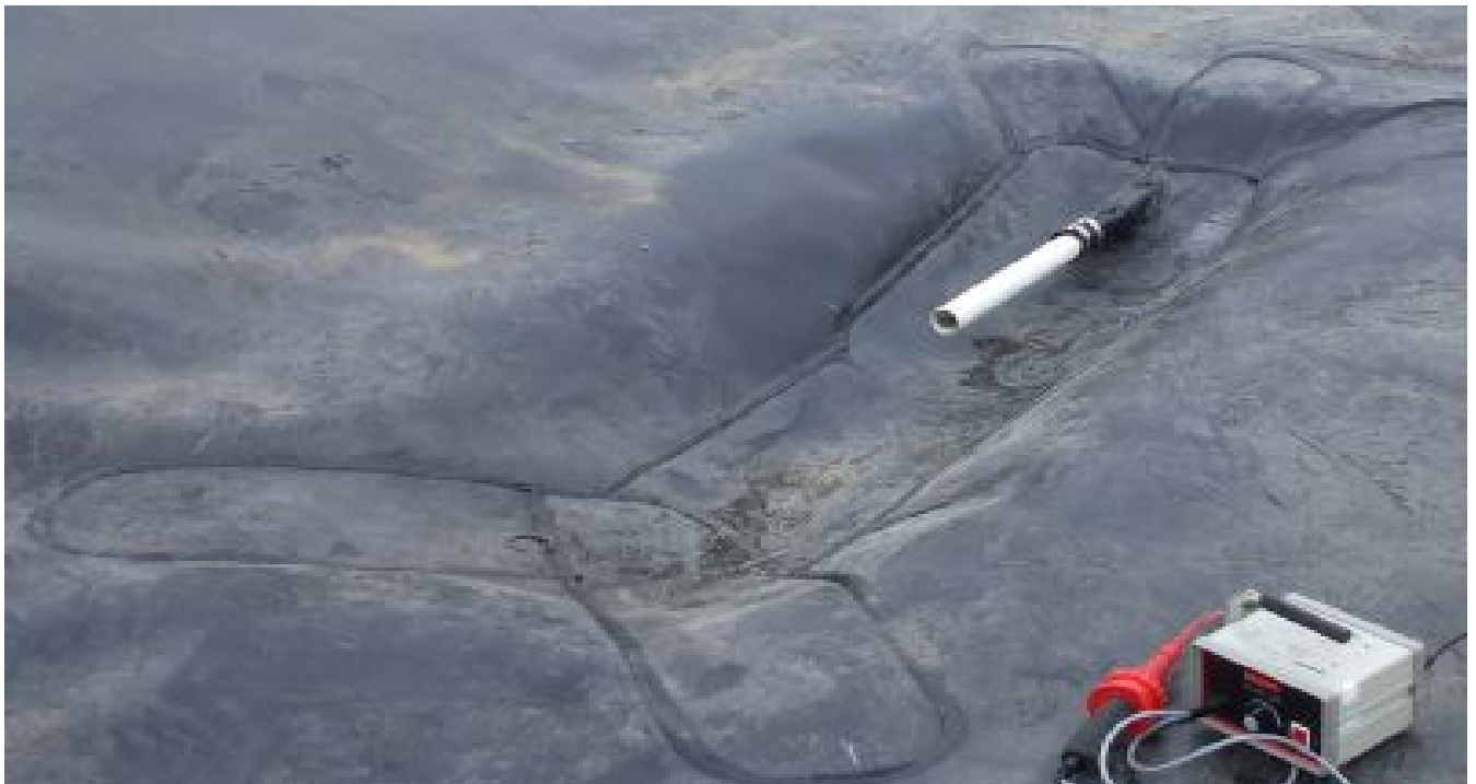
Drainage sump penetration and Spark Testing Apparatus.